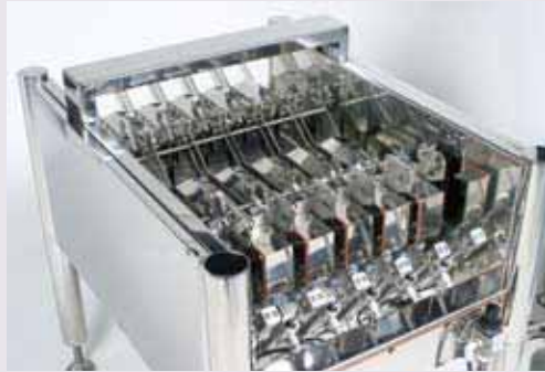
Main body without conveyor