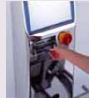
CF card slot